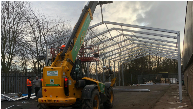
Images of the build that took just a few days from delivery to it being ready to use, complete with lighting and doors.

The extra 440 m2 of space has proved invaluable and is used for load-testing cranes with the remainder fitted with a mezzanine floor for two storey storage.