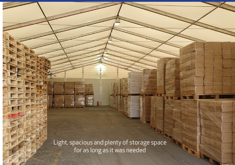
Light, spacious and plenty of storage space for as long as it was needed