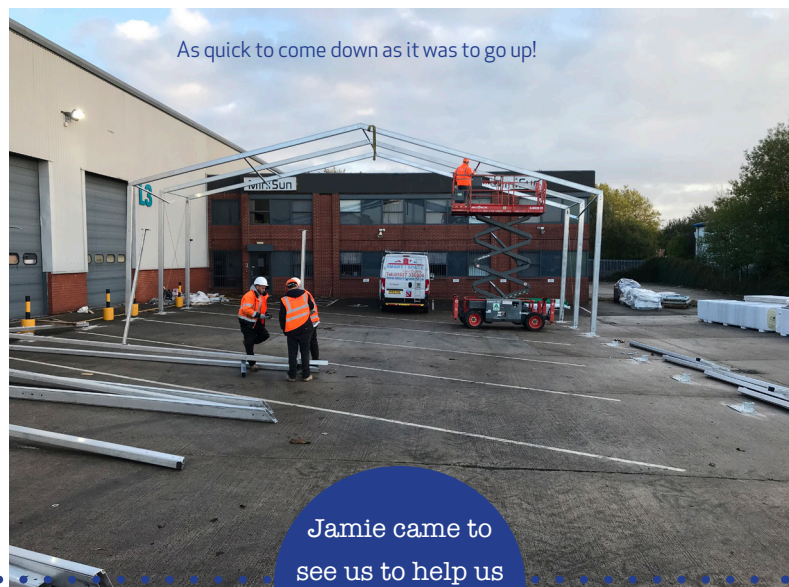
As quick to come down as it was to go up!

Jamie came to see us to help us understand our options